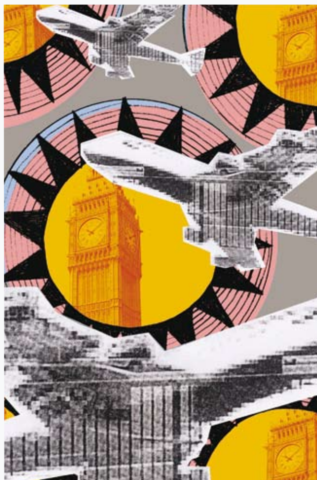
EMAMOKÉ UKELEGHE - TERIPENGLLEY